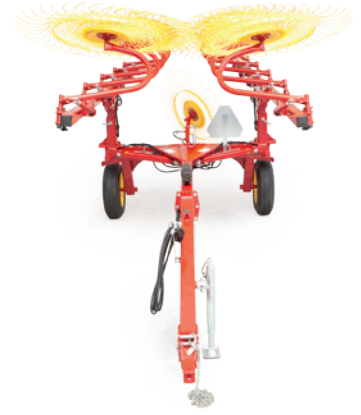
Folded for narrow transport