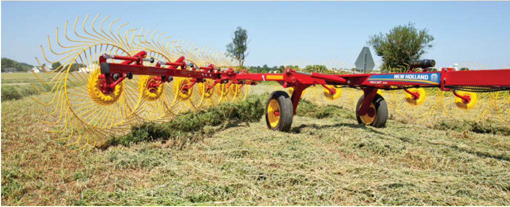
Field operating position